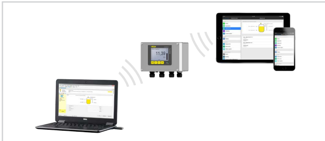
Wireless connection to smartphone/table/notebook

Operation is via a free app from the "Apple App Store", the "Google Play Store" or the "Baidu Store". Alternatively, adjustment can also be carried out via PACTware/DTM and a Windows PC.